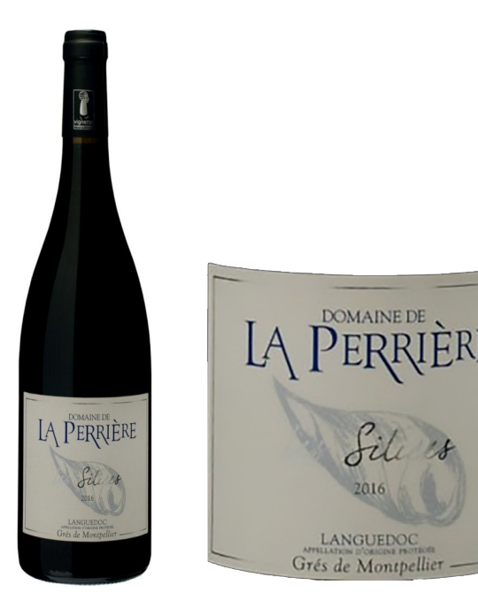
Figure 1. Example of a wine bottle exemplifying references to geology. Here, the estate name "domaine de la Perrière" is derived from a toponym indicating the past location of a quarry. In the appellation "Languedoc – Grès de Montpellier", the word "grès" refers to the pebbly soils of the area, "Les Silices" to the mineralogy of the local pebbles, and the background illustration is fossil sketch.

(cuvées/vintage), and descriptive texts of the back labels (De Wever et al., 2009). The diversity of references to geology can be illustrated with an example (Figure 1). In 2003, an appellation "AOC Languedoc – Grès de Montpellier" was erected for red wines produced on the hill slope facing the Mediterranean Sea around the city of Montpellier. The word "grès" does not refer here to sandstone ("grès" in French) but to an Occitan word for stones/pebbles. A local wine estate was named long ago after the local place name "Domaine de la Perrière", probably in reference to the past location of a quarry. This estate sells a wine vintage "Les Silices" the label of which exhibits the sketch of a fossil in the background. The vineyards, from which "Les Silices" is derived, grow on siliceous pebble stones and fossiliferous limestones.