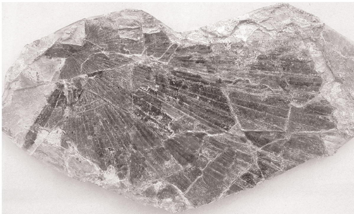
Fig. 2.- Fragment of a palm leaf ( Arecaceae ). Height ca. 40 cm. Inv.-Nr. MNHM PB 1999/1-LS.

outstanding importance. Furthermore, aspects of insect-plant interaction may be studied. The exceptional potential of that kind of preservation is demonstrated e.g. by honeybees ( Apidae: Electrapis spp.) still carrying their last pollen load and a leaf showing the characteristic damage produced by leaf-cutting bees (Wappler and Engel, 2002).